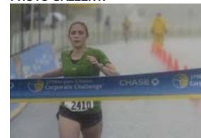
Chase Corporate Challenge